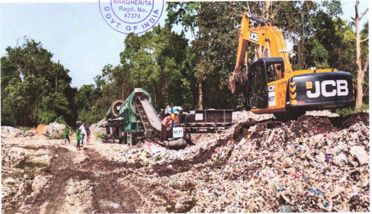
BIO MINING OF LEGACY WASTE AT OLD DUMPING SITE