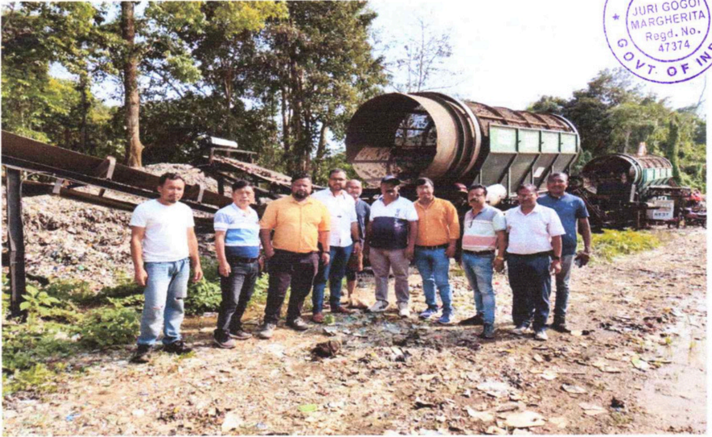
Visit of team of Digboi Municipal Board during Biomining of Legacy waaste